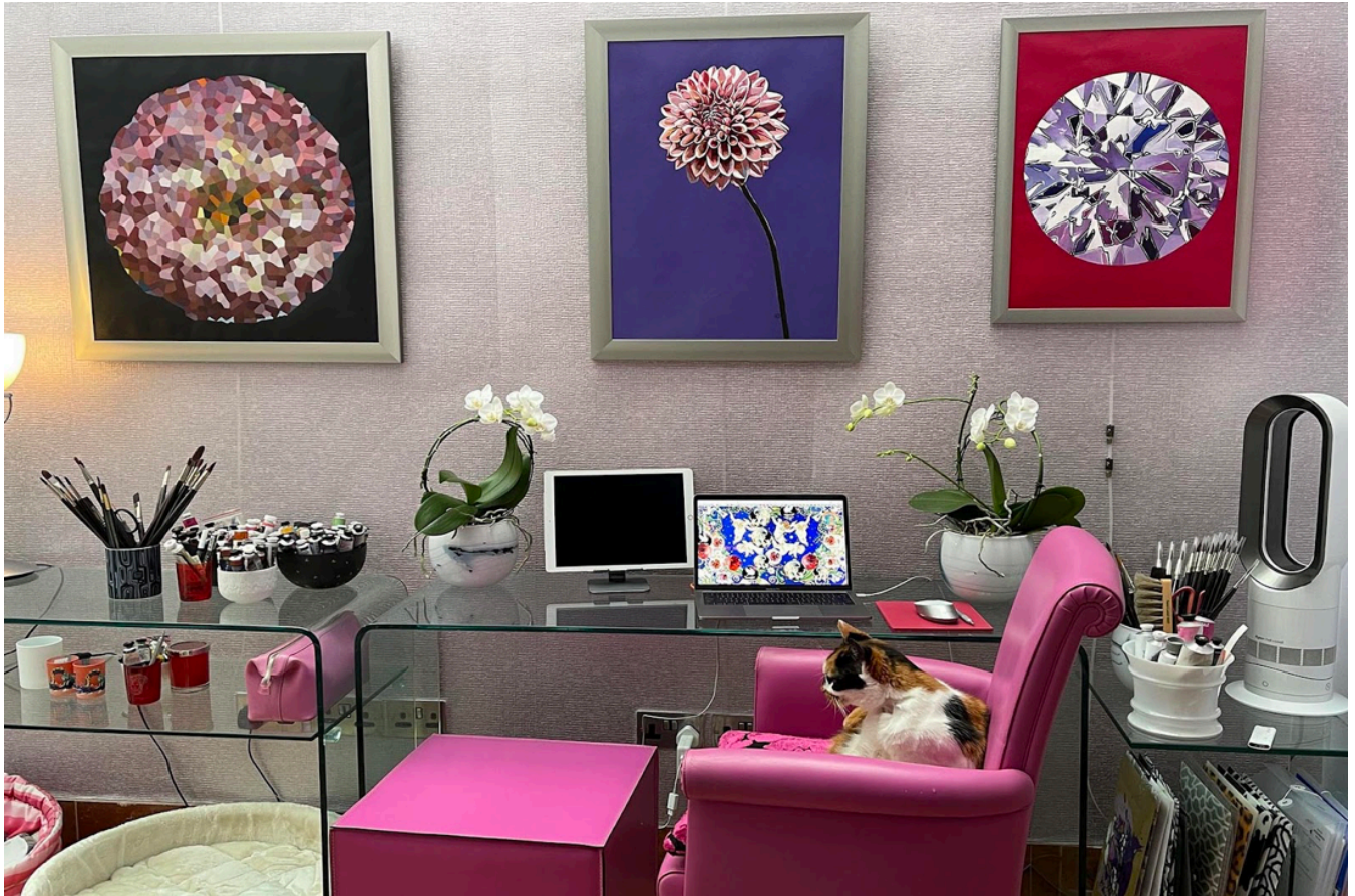
Bettina Newbery, STUDIO workspace 2023.