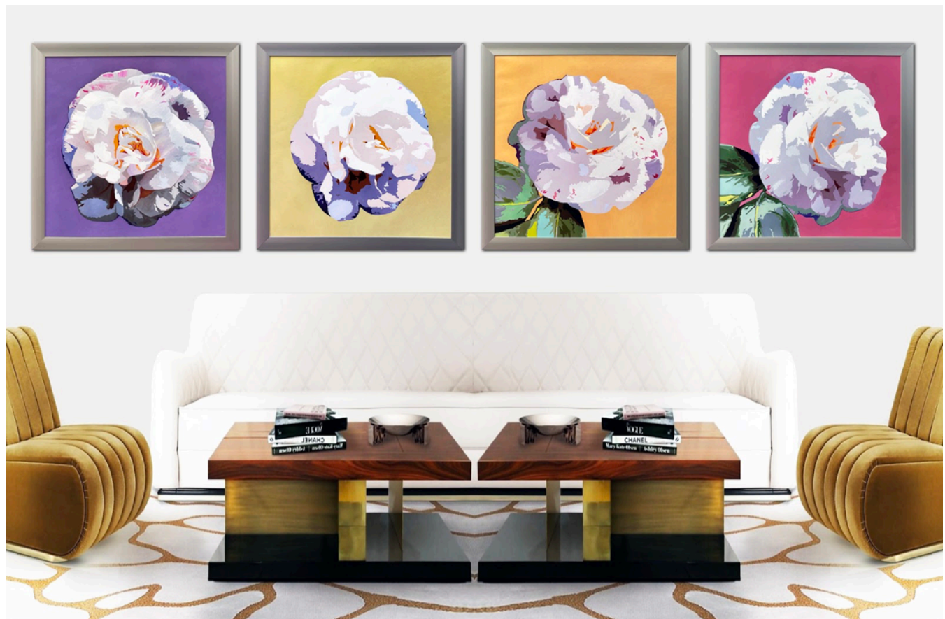
Bettina Newbery: BLOOMS CLEO, ROSALIE, ALYSSA, MAGGIE from Blooms Imagined, 2021.

Jill + Jasmine add sumptuous colour to your living or work space with lavish-looking blooms: well-formed lilac-pink soft petals pair with a neatly symmetrical, claret black flower ball that adds a bold shot of rich colour.