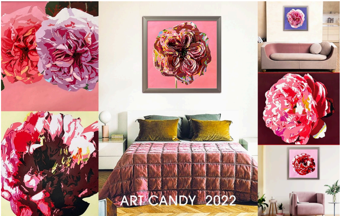
Bettina Newbery, A selection from Art Candy, 2022.

K: What are your next projects within and without the gallery Visionaire London?