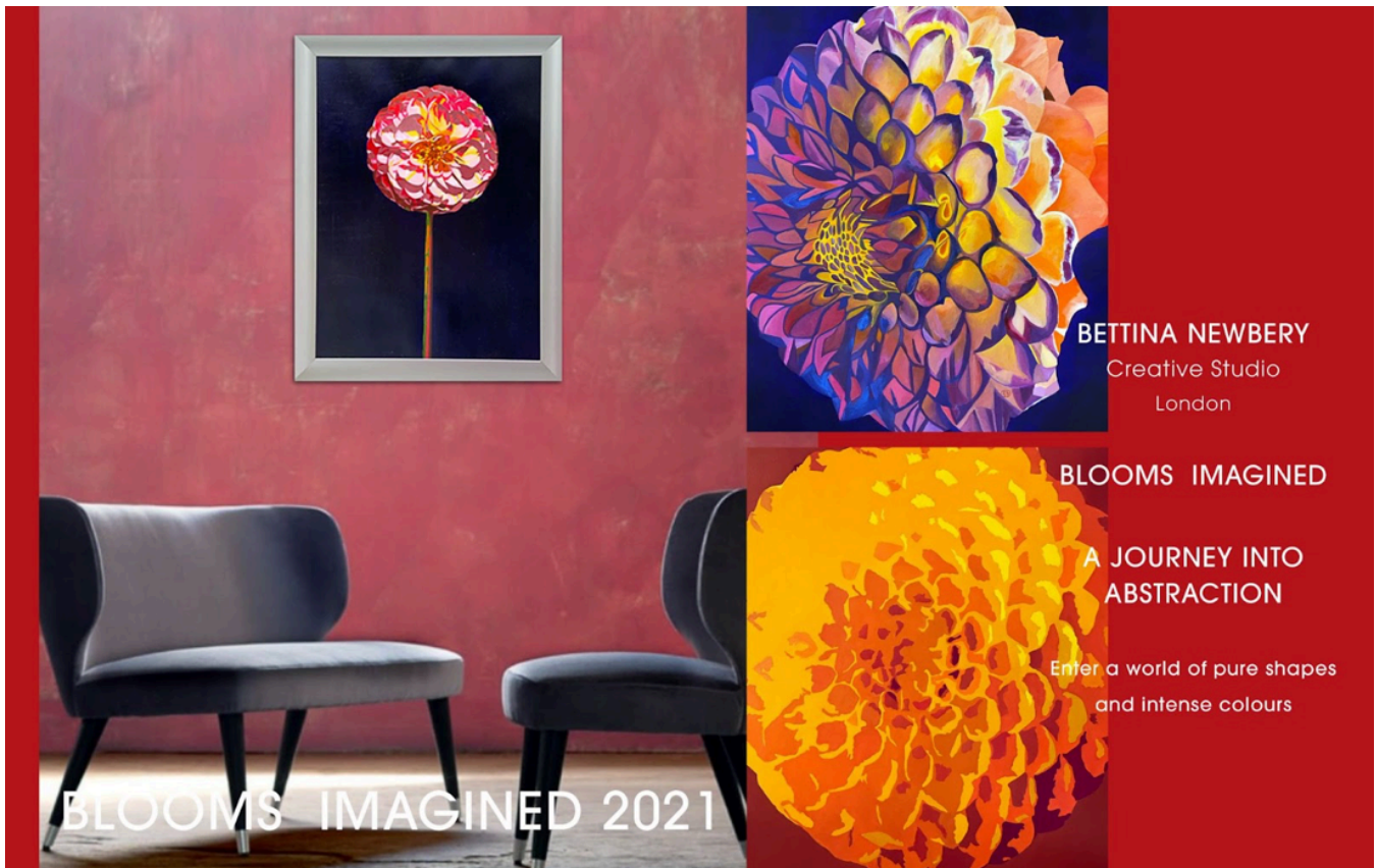
Bettina Newbery, Blooms Imagined, 2021. Courtesy VISIONAIRE LONDON ®

Related Articles: In conversation with VISIONAIRE LONDON®.