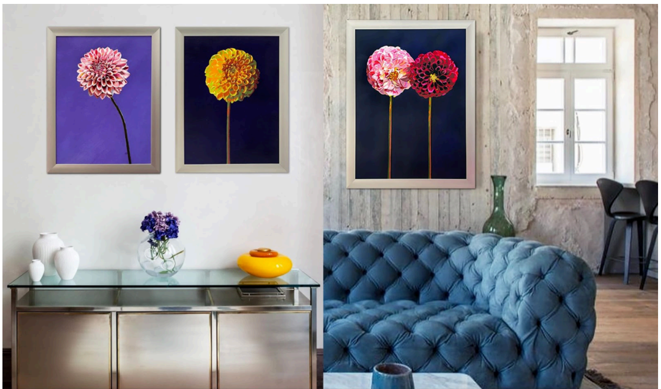
Bettina Newbery: BLOOMS LILY + SHIRLEY, JILL + JASMINE from Blooms Imagined, 2021.

The ray florets of beautiful luminous bloom Lily range from subtly streaked with creamy white and pale lilac-pink to a sumptuous apricot-pink and a warm golden peach pairing so decoratively with glorious Shirley in a warm blend of rich gold and warm copper.