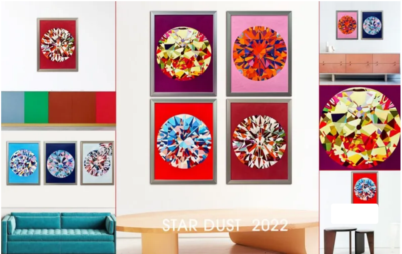
Bettina Newbery, Star Dust, 2022.

Stars are huge celestial bodies made mostly of hydrogen and helium that produce light and heat from the churning nuclear forges inside their cores. Aside from our sun, the dots of light we see in the sky are all light-years from Earth. They are the building blocks of galaxies, of which there are billions in the universe. It's estimated that in our Milky Way galaxy alone, there are about 300 billion.