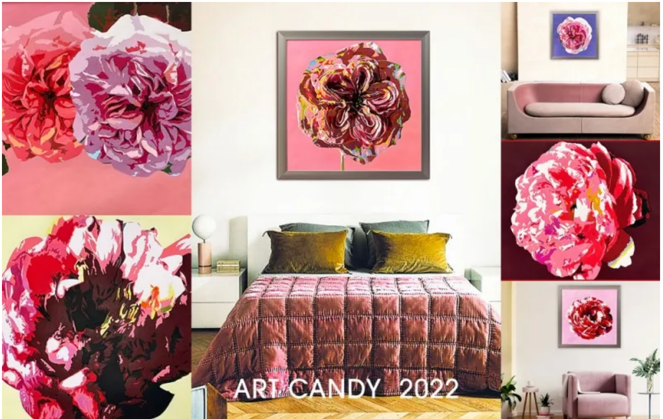
Bettina Newbery, Art Candy, 2022.

What are your next projects within and without the gallery Visionaire London? Can you anticipate anything?